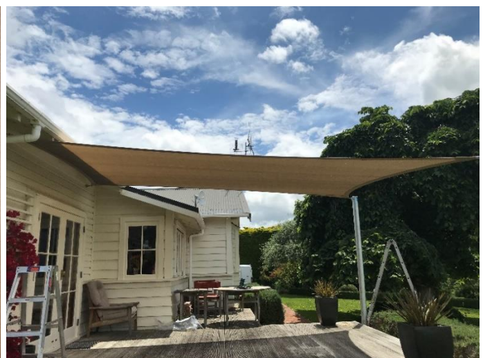
Typical Residential Shade Sail