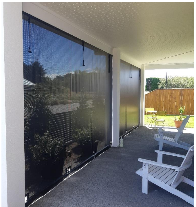
Outdoor 3000 Mesh Tension Blind