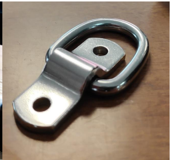
Flush Ring in Stowed Position