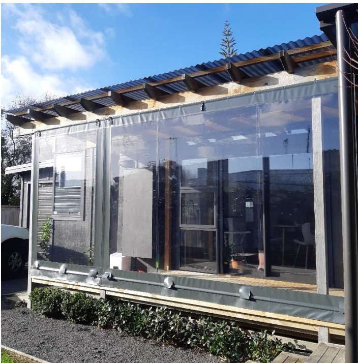
Clear PVC Tension Blind