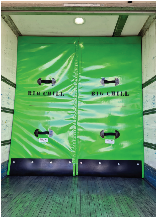
Thermal Barrier in truck

Please see the back cover for a measure sheet. You can also see more information on our website: https://straitline.co.nz/thermalbarriers